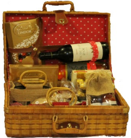
The raffle prize won at the December meeting