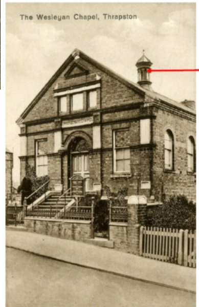
Methodist Church Tower

The photograph in the newsletter last month was the tower on the roof of the Methodist Chapel in Market Road.