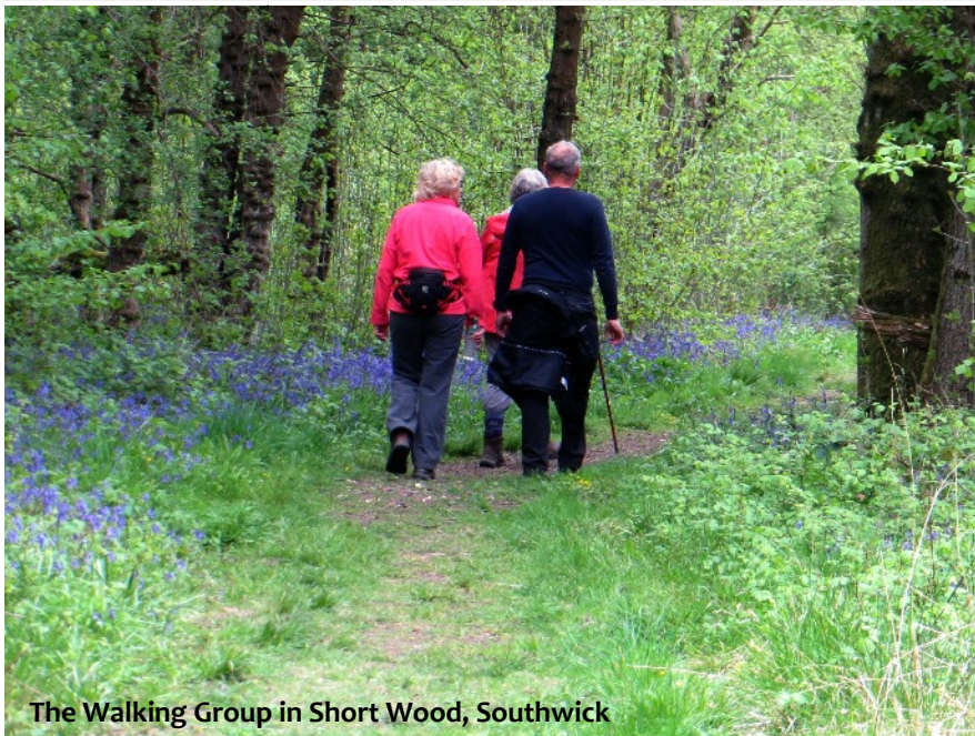
The Walking Group in Short Wood, Southwick

If you plan to pay at the AGM please arrive early and if possible pay by cheque which can be processed quickly by a team of helpers.