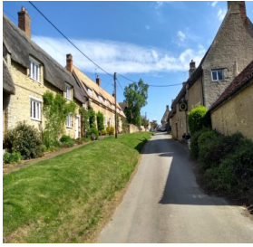
Wadenhoe High Street