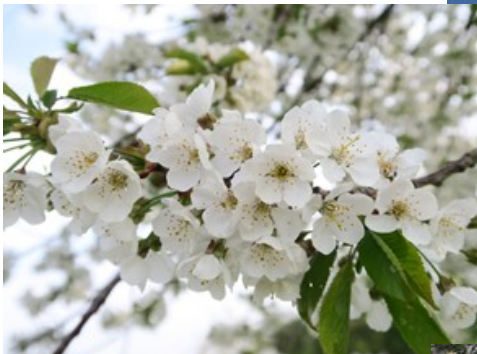
Lake Walk - April 2020