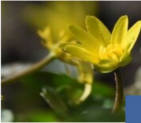
Celandine - Aldwinkle