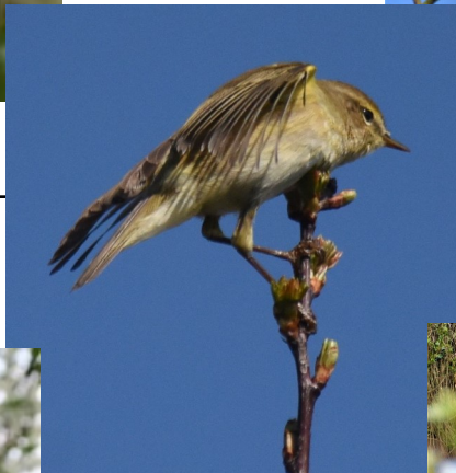
Chiffchaff - Aldwinkle