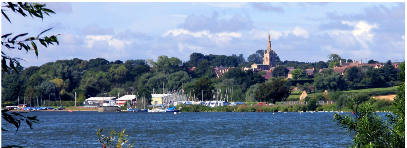
Islip viewed across the Thrapston Boating Lake with the Sailing Club in the mid-foreground

From the Editor I approach this new task with some degree of trepidation. How critical are readers going to be of my style, my grammar, my spelling, my syntax. Well, here is my first effort and unfortunately, it is a bit rushed. I hope that future editions will be improved by having had more time to prepare and format; and hopefully receive constructive feedback. Please contact me if you have any matters you wish to Continued on page 4